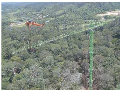
A canopy crane established in Sarawak State, Malaysia