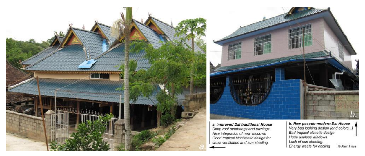
a. Good improved Dai traditional house - b. Bad "pseudo-modern" Dai house

But would it be fair some people are obliged to live in their traditional houses or ancient buildings while others enjoy more comfort in modern buildings? The answer is obviously: No! But often, restoration, well-done improvement or modification of traditional houses ( Pict.: Dai house a. ) or ancient building could be much more convenient, also for more comfort and economy. Generally, affordable modern buildings or houses have smaller living areas, and they are often not so comfortable as they seem, especially in rural or semi-rural areas. The new buildings layouts try to simulate urban patterns, mainly for a question of status and do not pay so much attention to the climatic differences between regions. Orientation, window sizes and locations, roof types and so on are too often completely wrong ( Pict.: Dai house b. ). Following the regions, it is not rare to find new "modern" houses that are like fridges in cold areas or like overheated greenhouse in tropical areas.