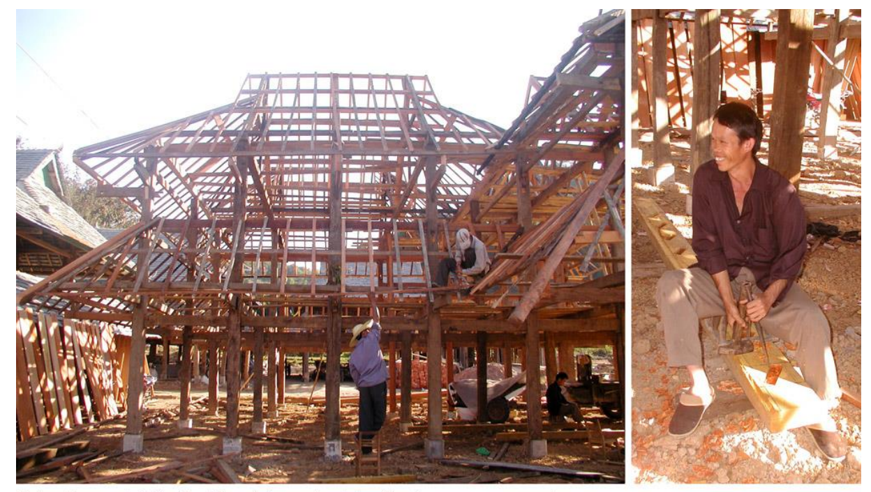
Dai wooden carpentry built with art. Strong indigenous knowledge of local ressources management. Cheng Zi Village, Menglun, 2006.

While the XTBG research center was in the process of being built, at the same time, the Dai and Hani built heritage, so significant not only as unique vernacular architecture but also for nature conservation, was seriously threatened in the face of rapid urbanization of the small city of Menglun. Many authentic wooden villages with their typical windowless houses on stilts are fast being lost to urban development.