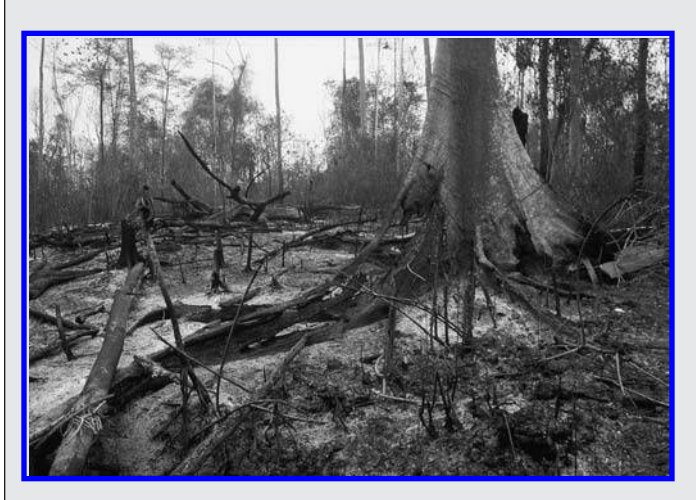
Figure 2. The burned forest at Sungai Wain following the fires in 1998. Over 60% of the park was burnt, leaving only about 4000 hectares of primary forest. However, it remains an important site for sun bear (Helarctos malayanus) conservation.

Sungai Wain's (S 1°16' E 116°54'; 9783 hectares) recent trajectory could not be more different from that of Lambir (box 1), but just 10 years ago, it appeared to be a lost cause. During the strong El Niño droughts in 1983 and 1998, approximately 60% of the reserve was burned (figure 2; Slik 2004). Simultaneously, it was suffering from poaching and illegal logging (Fredriksson and Nijman 2004). However, recognizing the importance of the forest for water security, in 2000, the city of Balikpapan set about improving Sungai Wain's protection. Regular enforcement patrols were established, and