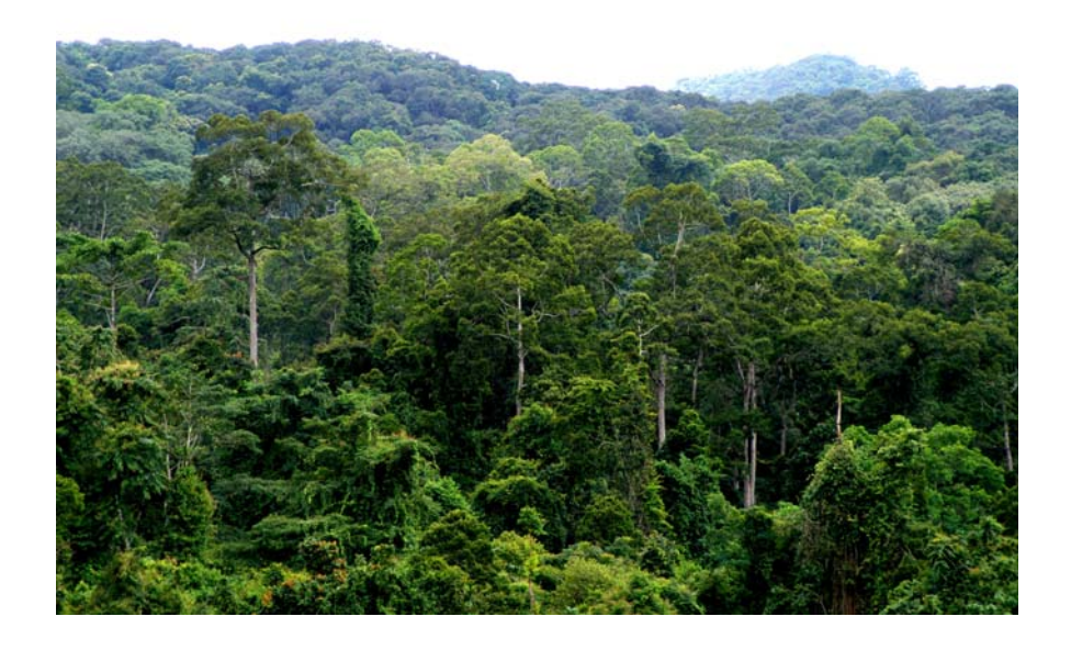
Fig. 2. The tropical seasonal rain forest in southern Yunnan, China

The long-tailed rank/abundance diagrams of the tropical seasonal rainforest indicate that the species with small population sizes make up an unusually large proportion of the total species composition [8, 16]. The frequency patterns also revealed that 40%-60% of tree species have only one individual, and 30%-40% of tree species two to five individuals. Fewer than 15% have 6-10 individuals and fewer than 10% have more than 10 individuals, from a 0.25 ha sampling plot [20].