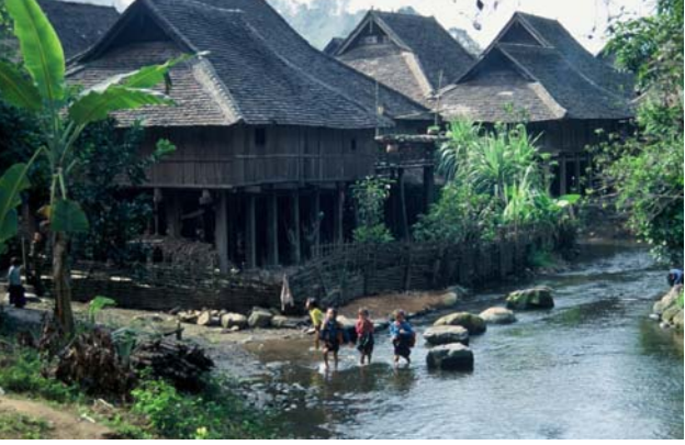
Fig. 3. Left: People of village of Yao. Right: Village and people of Dai. Southern Yunnan, China