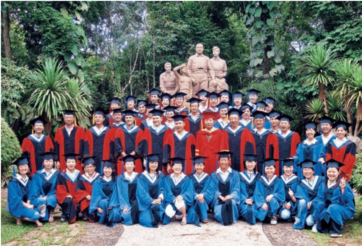
Graduation ceremony 2008

As an academic institution, XTBG been engaged in graduate training and has offered Master and Doctoral degrees since 1986. Currently, there are 172 graduate students studying in the garden, 60 of them are doctoral candidates including 2 foreign students. 37 senior researchers are qualified to supervise graduate studies in the fields of botany (17) and ecology (20). In July 2008, 59 students accomplished their study and graduated with 41 MSc degrees and 18 PhD degrees.