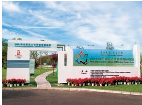
Exhibition entrance-The exhibition is located on the Science and Technology Park of the Chinese Academy of Sciences, Olympic Village, Beijing

used in the exhibition posters, as well as video, plant displays, and other publicity materials. In the plants display and exit area, there is a large (5.5m x 7.5m) LCD screen playing video provided by XTBG.