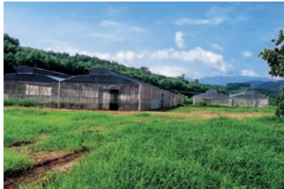
A bird's-eye view of the new 23-ha nursery

The third-phase knowledge innovation program “Landscape Optimization of Tropical Living Collections” launched in 2008 and it is in smooth development. Design for a number of collections, including vine garden, energy plants collection, wild edible plant collection, collection of typical tropical plant species, riverside seasonal rainforest plants collection, and a 23-ha nursery, was completed. Plants chosen for these collections have been introduced, or propagated.