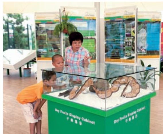
The big dry fruit of Entada phaseoloides attracts many visitors