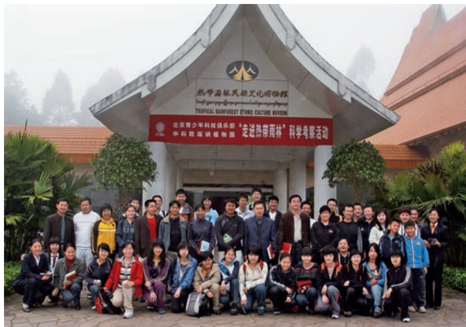
Participants of winter camp