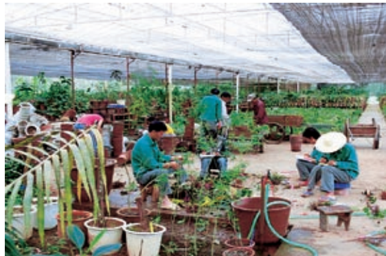
XTBG staffs are working on the newly introduced plants