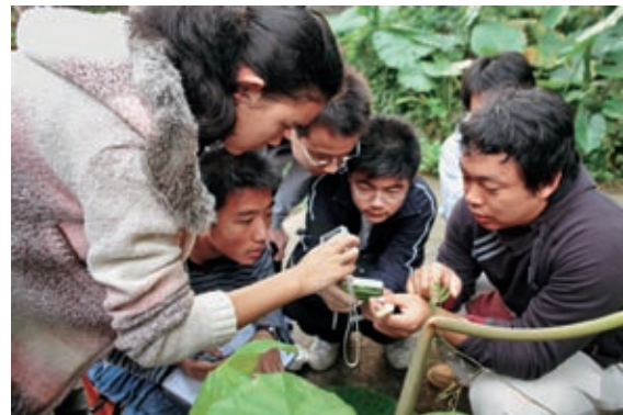
Exploring the arcanum of Alocasia spathe spadix

“The winter camp brings us to the mysterious tropical rainforest. We enjoyed our journey and get interested in the rich biodiversity in the tropical rainforest. We also had a better understanding on the importance of protecting environment” said a camp member on the summary meeting of the camp on January 30.