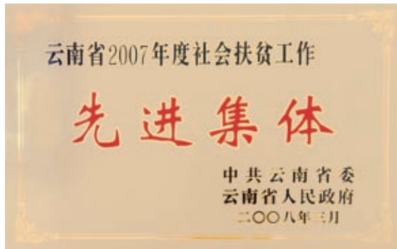
Certificate of Award

XTBG wins the title of Advanced Collective for work in poverty alleviation in Yunnan Province in the year of 2007. While enhancing work in scientific research, species preservation, public education and landscape optimization, XTBG has taken the responsibility of reducing poverty for the locality, especially for Mengla County over the past years. XTBG has provided technical support, established joint poverty alleviation fund with Mengla, and sent scientific personnel to manage development-oriented poverty alleviation programs. The contributions have been given positive recognition from local governments at different levels.