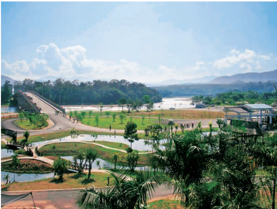
The Luosuo river bridge & western entrance

The new visitor center houses a diorama of XTBG, a souvenir shop, an information desk, first aid, ATM, VIP rooms, meeting rooms, a mother-and-child room, a room for drivers and cicerones, and a refreshment bar. With the installation of air-conditions, elevator, TV sets, telephone, fax machine, and broad band network service, the new visitor center will help the garden meet the needs of its expanding audience.