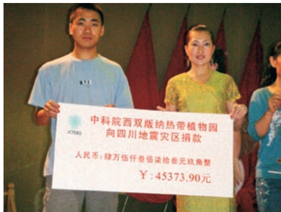
XTBG staff members donate to help the people in Sichuan Quake

At XTBG, 727 staff members and their relatives made their voluntary contribution to help the people in Sichuan Quake and post-earthquake development. More than 75 thousand Yuan have been donated to Yunnan Red Cross.